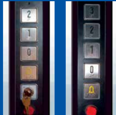
Button with/without latchkey