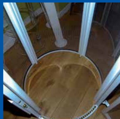
Non fumed polycarbonate