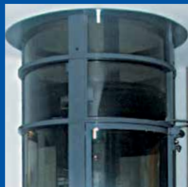
Blueish gray Color RAL 7024