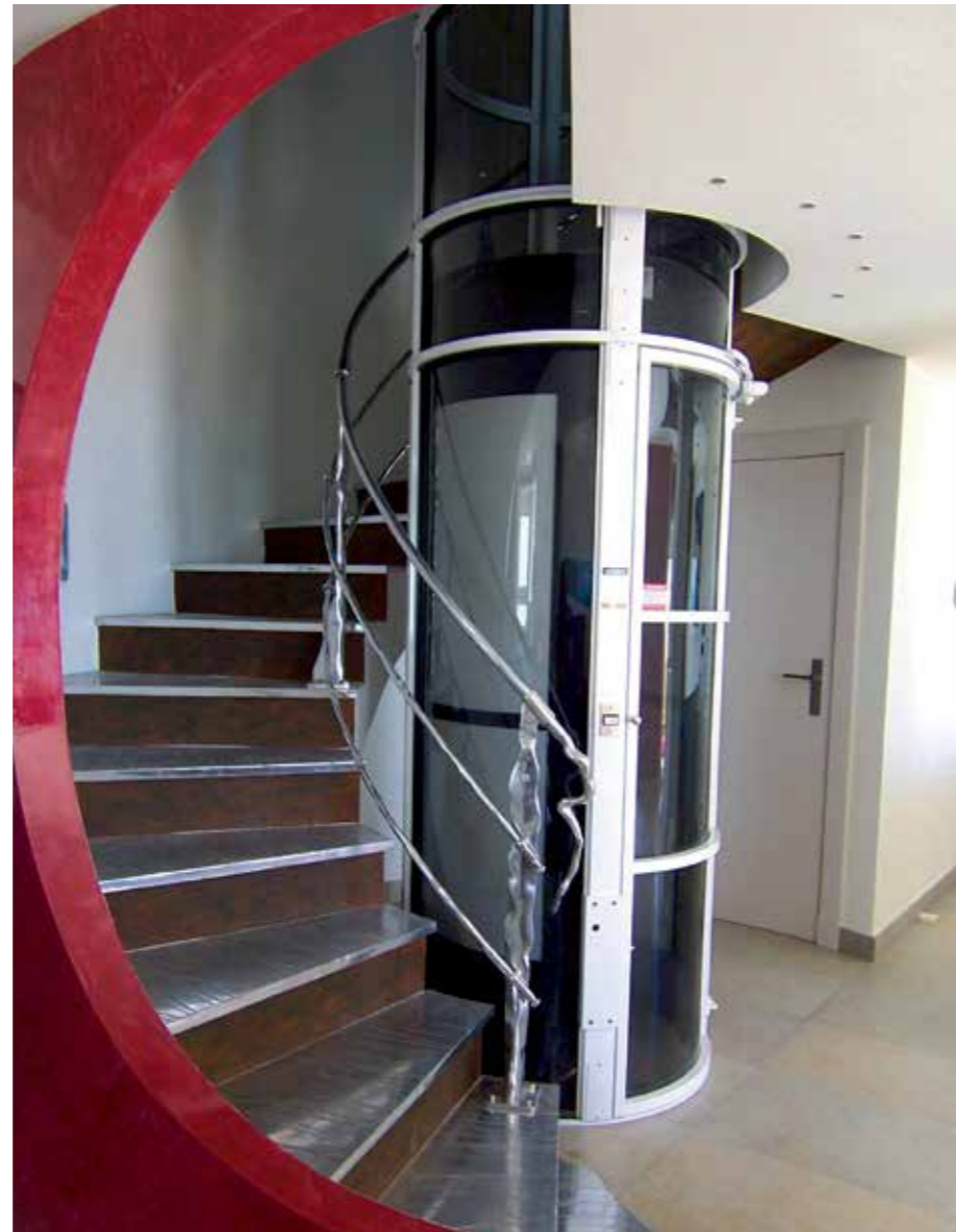
Safe and Eco-friendly