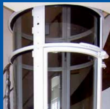
White Color RAL 9016