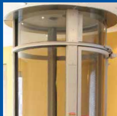
Aluminium Color RAL 9006